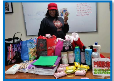
Delta Dears Christmas Donations

Lakeside Community Committee adheres to the following beliefs: