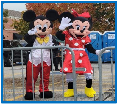
Discover Community Center Thanksgiving Turkey Giveaway