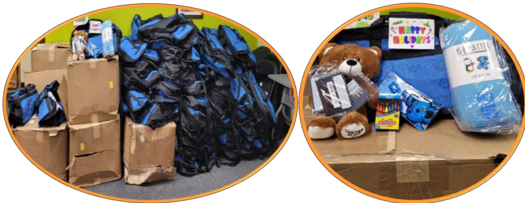
Discover Community Center 200 tote bags containing school supplies, gift card, blanket and teddy bear