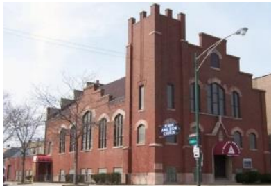
ST. MARK A.M.E. ZION CHURCH - CHICAGO