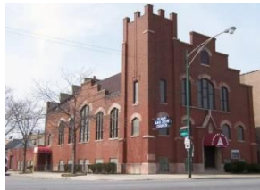
ST. MARK A.M.E. ZION CHURCH - CHICAGO

Quality Services. Adequate Funding. Measurable Results.