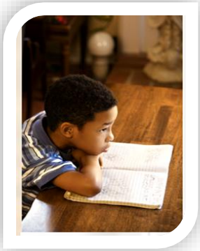
Hope House provided services during FY' 20.

HOPE House is an emergency shelter that provides housing for Youth in Care in emergency situations. This Shelter houses Youth in Care who disrupt their placement in either their biological home, foster care home, or residential/group homes. We currently have 3 males and 3 females; this facility's capacity is up to 8 youth ages 6 to 12.